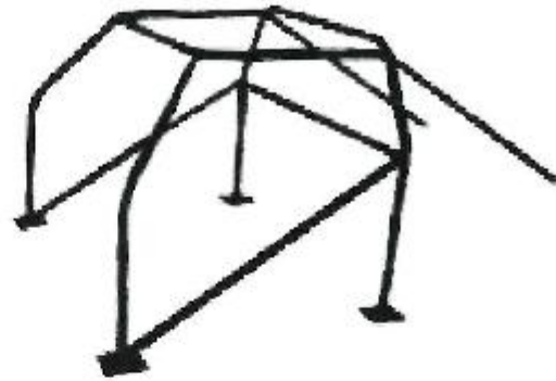
Legal to use but not required