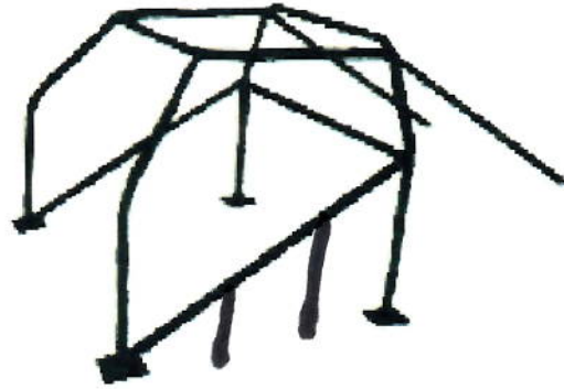
Legal to use but not required