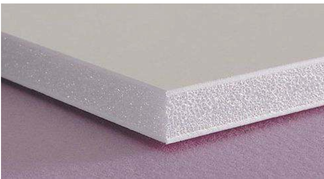
3/16" Foam Core